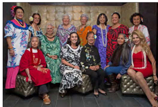
Photo Shoot at the Lexington

In October, the piece debuted where it all began - New York City. HPS led a delegation of 30 back to NYC for a week of Hawaiian Room celebrations with friends and family. Seventeen "Ex-Lexes" reunited from across the country, danced together in the old Hawaiian Room at the Lexington, renewed friendships, and received a standing ovation at the premiere. In November, the documentary film screened to a sold-out crowd at the 'Ōiwi Film Festival, and the evening was again highlighted by beautiful hula from the "Ex-Lexes". The film will be available for purchase on DVD in 2015. Thank you to all who made this amazing year for the Hawaiian Room possible!