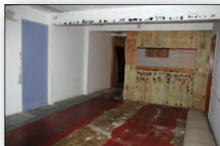
In November 2012, HPS volunteers held a "demo party" to find the walls under all the padding in the long-time recording studio

Thanks to your 2012 donations, we were able to renovate our new downstairs space and move in as of February. The upstairs is now dedicated to our burgeoning Archives. To that end, we have established ongoing relationships with Windward Community College, Nā Hawaiʻi 'Imi Loa (grad student hui) of UH-Mānoa's Library-Information Science Dept, & Hakipu'u Learning Center Public Charter School. We enjoy regularly working with students in all stages of their academic & cultural pursuits.