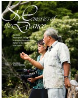
"Memories of the Dance" Hana Hou Magazine, Hawaiian Airlines Dec 2011/Jan 2012 issue www.hanahou.com click on "Site Archive" go to "Vol 14, no. 6"