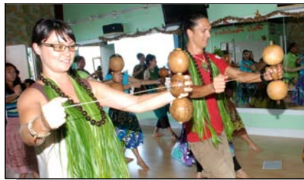
Trying the challenging 'ūlili for the first time. Pull that string!