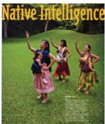
"Hula For Two" Hana Hou Magazine, Hawaiian Airlines Aug/Sept 2011, about Babywearing Hula www.hanahou.com click on "Site Archive" go to "Vol 14, no. 4"